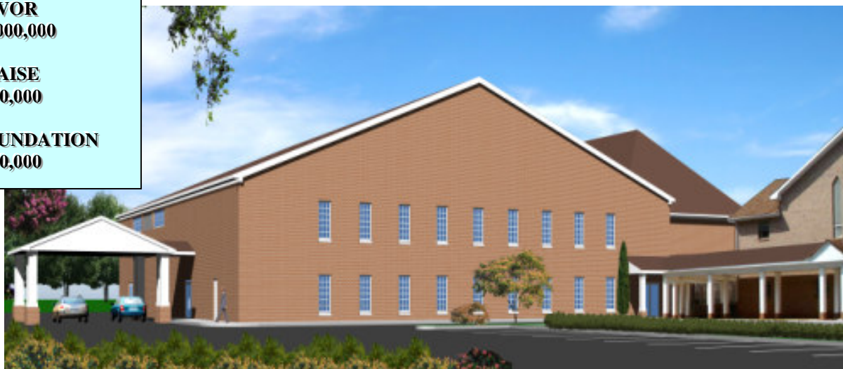
Multipurpose / Fellowship Building